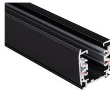
33232 TEAR N TR 2M-W

Track system component, TEAR N TR 2M-W, 3-circuit track, white, (33232)