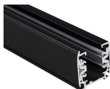
33232 TEAR N TR 2M-W